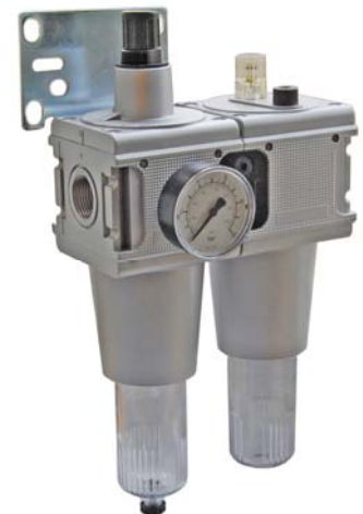
Maintenance unit NWE 1