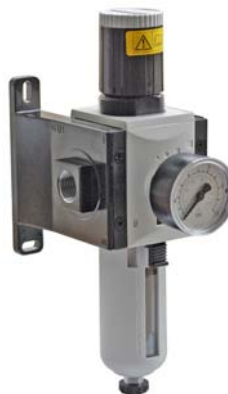
Filter regulator NFR ¼, NFR ½