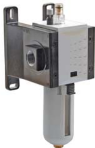
Lubricator NOE ¼, NOE ½